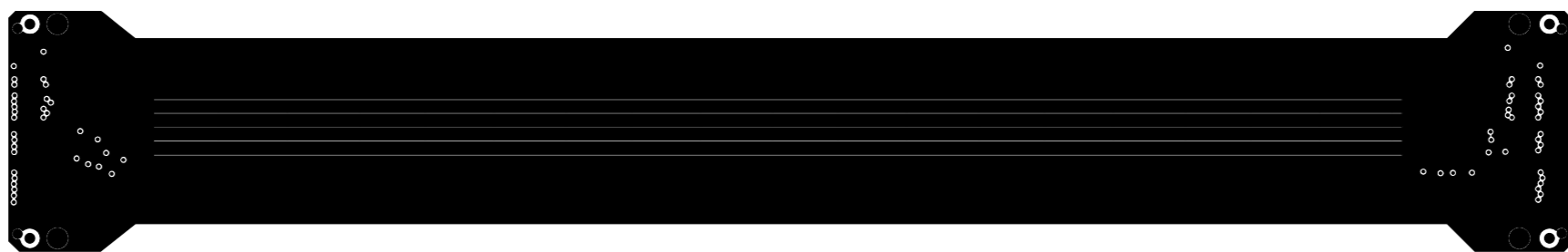
Film 5 - Bottom