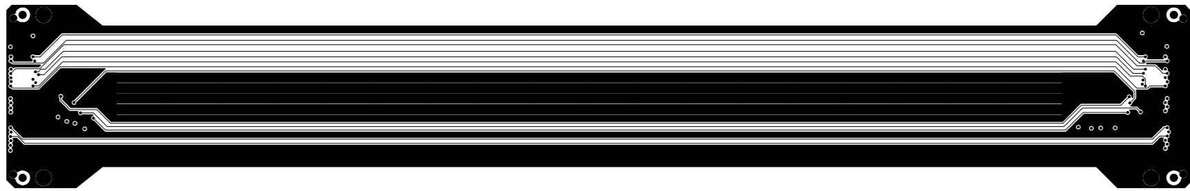
Film 2 - Signal 2